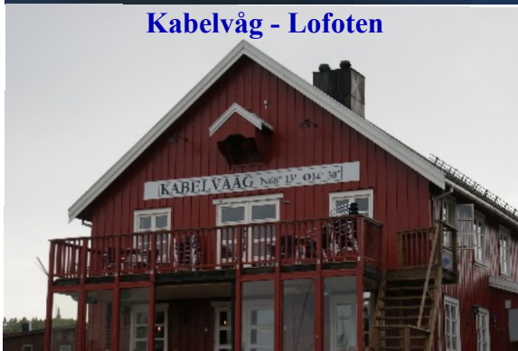
Kabelvåg - Lofoten