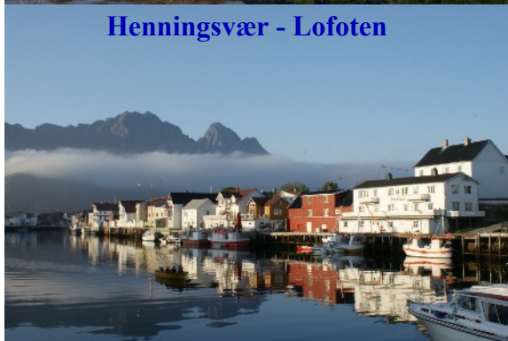
Henningsvær - Lofoten