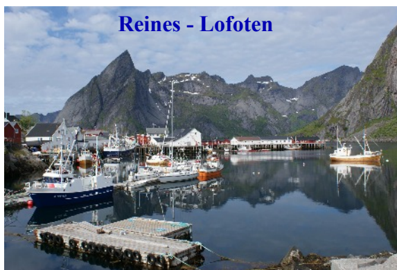
Reines - Lofoten

Hence the “land of the midnight sun”. In June even though the sun may partially go below the horizon it will not go dark