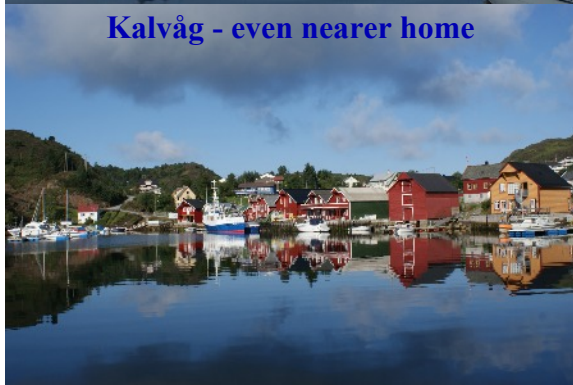
Kalvåg - even nearer home